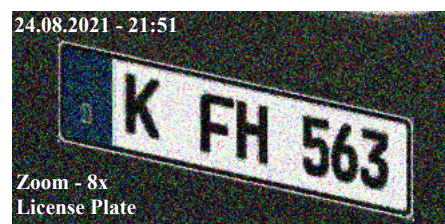
Image3- License Plate

All images and descriptors are generated electronically via the systems of the Camera Enforcement Unit of the Municipality of Bonn.